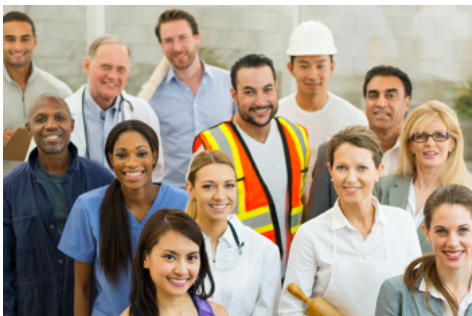
Getting a Job