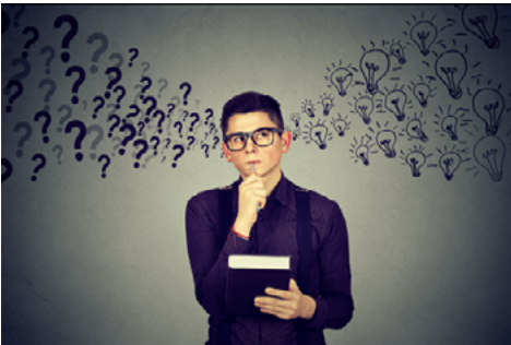
How to choose the right subject or course