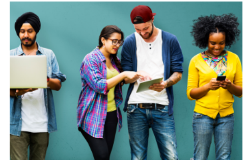
Choosing subjects and courses at 18