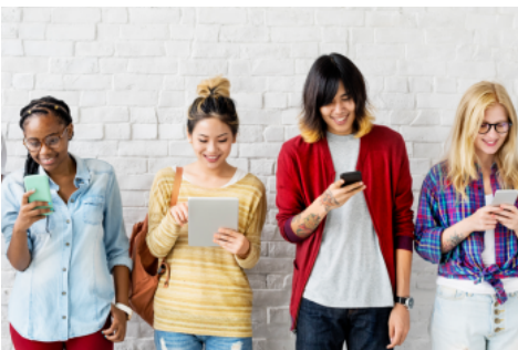
Options at 16