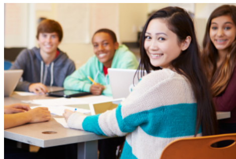
Options at 18