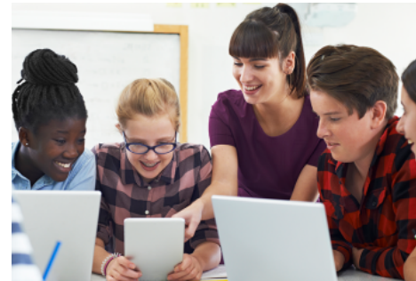
Choosing subjects and courses at 16